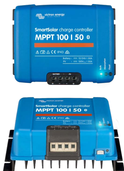
SmartSolar Charge Controller MPPT 100/50