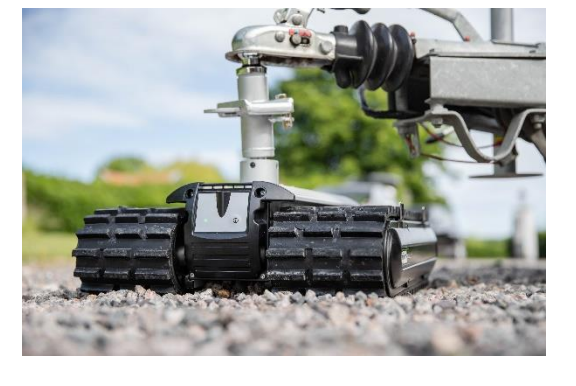
Illustration of the Robot Trolley mounted on the side members of the caravan:

VARIANTS CT2500 is equipped with a tall or low tower with ball joint CT2500 Tall tower CT2500 Height is adjustable Low tower