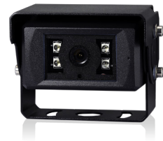
69° Camera VT639508