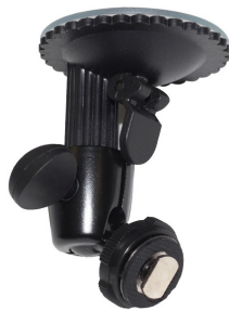
VT547 Suction Mount