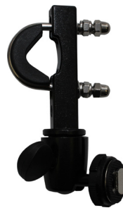
VT550 Clamp Mount