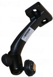
VT540 Overhead Mount