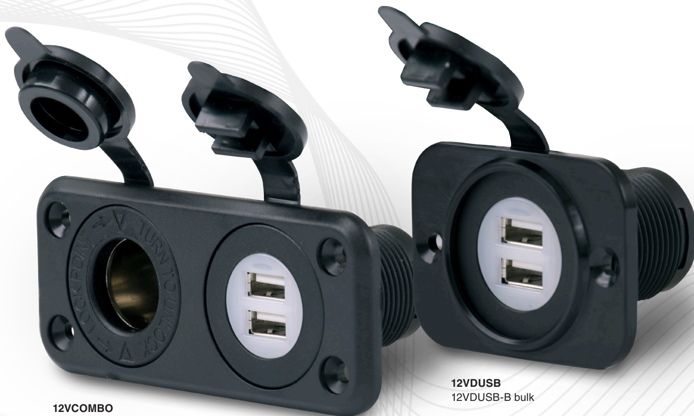
12VCOMBO 12VCOMBO-B bulk