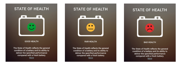
Figure 6: Battery State of Health

The battery's State of Health indicates the battery's ability to deliver the nominal battery capacity entered at set-up.