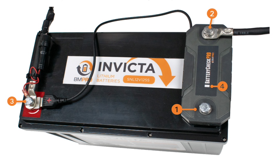
Figure 3: Guide to BatteryCheck installation