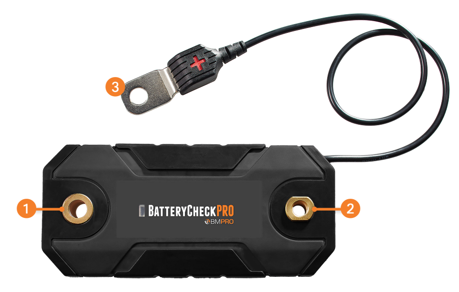
Figure 2: BatteryCheck description of parts