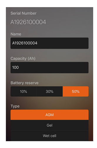
Figure 4: Setting up battery parameters