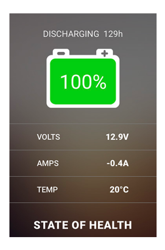
Figure 5: The Dashboard